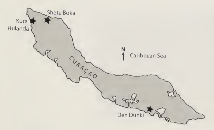
Figure 1. Map of Curação and study sites.

differed in color and scalation and, if so, which side of the dewlap was yellower and which more orange. At Den Dunki, the dewlaps of some animals were scored from photographs; at the other two sites, all scoring was done on live individuals in hand. Scoring was subjective, but was in almost all cases very obvious, as Figure 2 and Gartner et al. (2013, fig. 2) demonstrate.